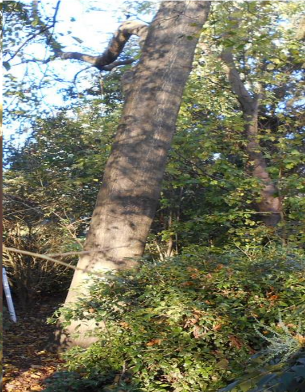
Behind the Book Room